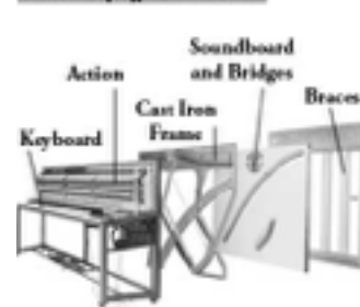
General Upright Construction