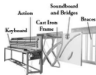
General Upright Construction